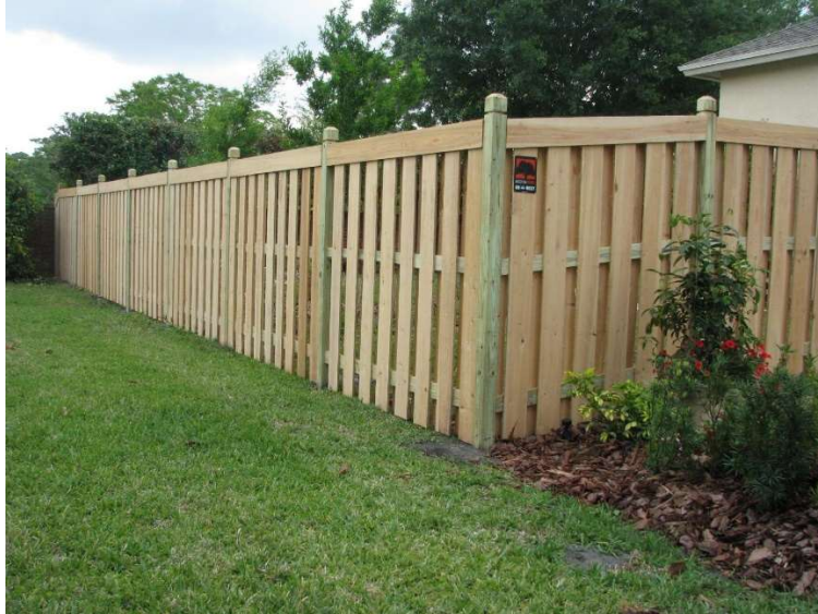
**SHADOW BOX with cap